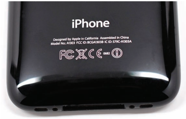
FIGURE 4.3 You can determine the iDevice model number and other metadata by viewing the rear case.

Use Table 4.1 as a reference to determine a model number.