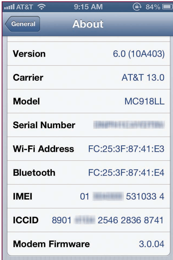
FIGURE 4.1 We can determine an iDevice serial number from within iOS.

You can check your iDevice serial number in iOS 6 by navigating to Settings, tapping General, and then tapping About. This interface is shown in Figure 4.1.