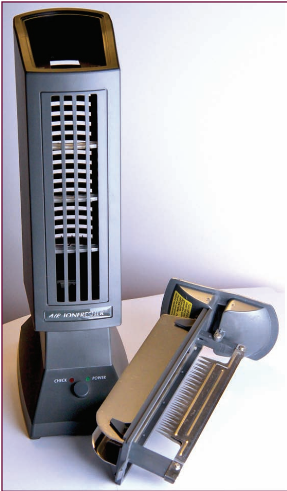
FIGURE 4.4 A representative bench-top ionizing blower.